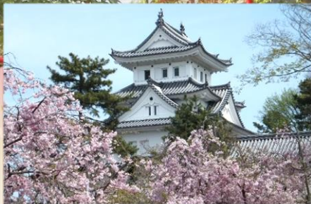
大垣城 Ogaki Castle