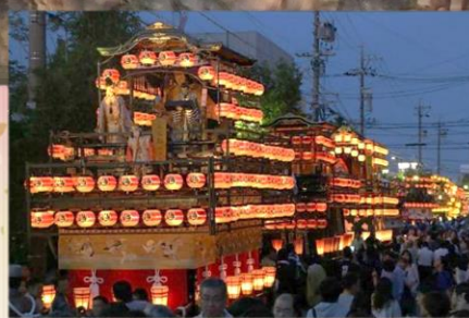
大垣节 Ogaki Festival

It is a station of JR Tokaido Line, Yoro Railway and Tarumi Railway. It takes about 10 mins to Gifu station, and takes about 30 mins to Nagoya station.